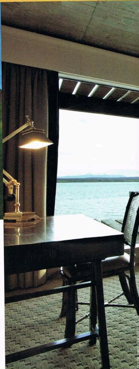
Clockwise from top left: The dock once welcomed steamships from as far away as Europe. LED fixtures illuminate guest corridors paneled in steel. Bathrooms have radiant-heated cement-tiled floors. Oak from railroad ties and carts, found on-site, clads the freestanding spa. Furnishings in a guest room evoke the property's British heritage. The spa features an indoor-outdoor swimming pool.